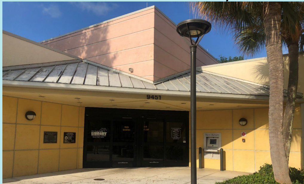
A Social Story About Going to the Library

I am going to the West Boynton Branch Library.